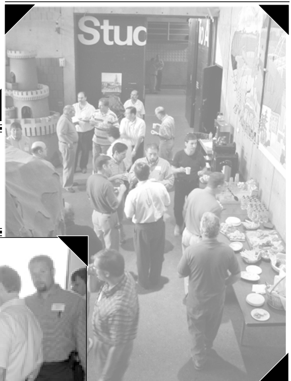
We snack among Mr. Rogers memorabilia.