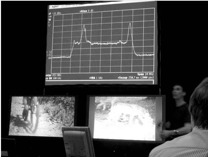
Gary was able to crank in different amounts of digital/analog interference to see the results at the July DTV Seminar.