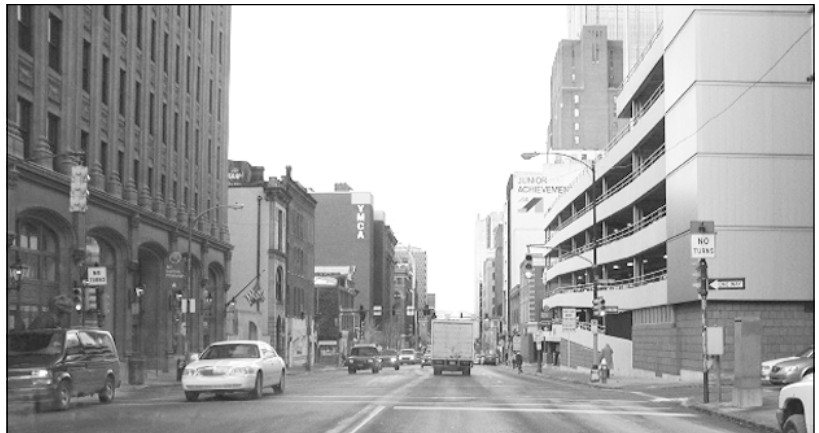
The Art Institute is that tall building right across from the parking garage, very soon after you turn left onto the Blvd. of the Allies from Grant Street.

Come off of the Parkway using the Grant street exit. From Grant Street make the left onto the Blvd. of the Allies. Come down the blvd about a block and a half and the Art Institute will be on the left side of the street, parking garage on the right.