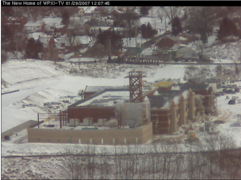
Tower cam shot of WPXI's new 72,000 sq. ft. facility located on the corner of Evergreen and Ivory roads. They plan to relocate in September of 2007. The tower and transmitter will remain at their current location.